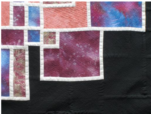
Detail image of artwork

This piece is part of a new series of art quilts based on the art deco influence from 1910 to 1939. Commercial fabrics and batiks are used to create the art deco design in this quilt. The design is carried out to the edges of the piece from the center design with dense hand stitching imitating the constructed design. A very tactile art work; art collectors want to touch and feel when they view it.